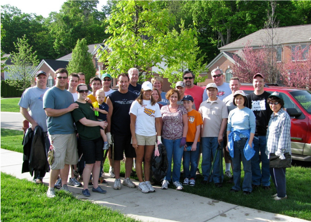
2011 SPRING CLEAN UP VOLUNTEERS

HELP CONTROL HOA DUES AND COSTS.... DO YOUR SHARE BY VOLUNTEERING SOME TIME